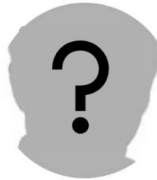
Identity Programme Manager Biography